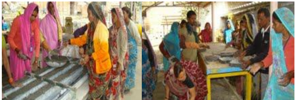
Women undergoing training and attempting to do things on their own

They have never done such type of construction/production work in their lives. As mentioned earlier apart from the technical training these women also got basic orientation training on life skills like; health, hygiene, safety, security, normal accounting etc. The main objective was to increase their self reliance and capacity building.